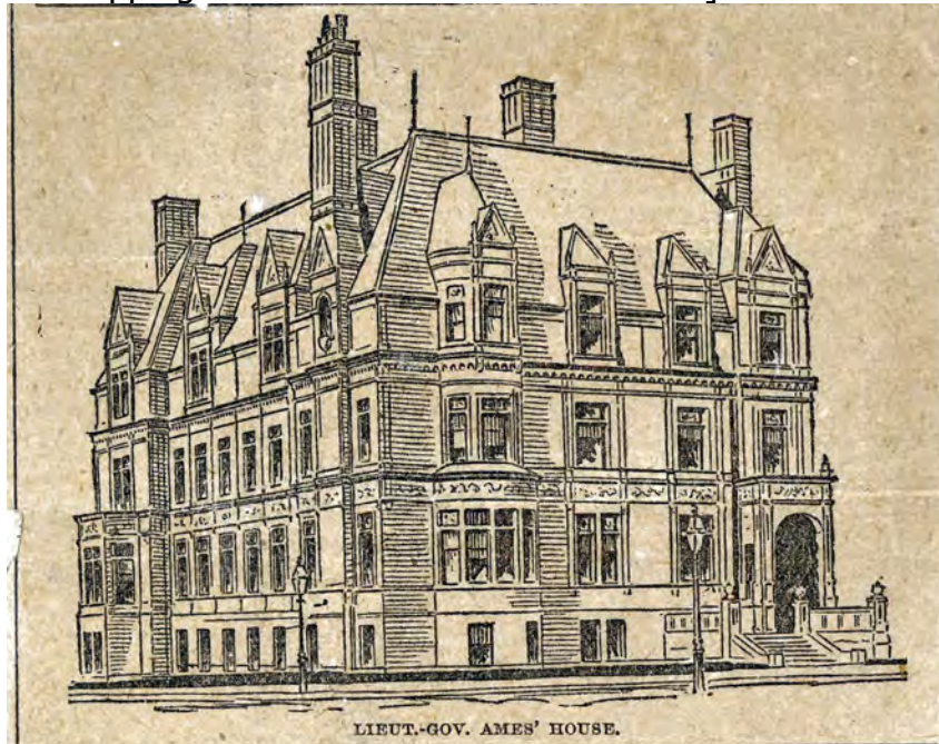
LIEUT.-GOV. AMES' HOUSE.

[Undated 10 – clipping about Lieut.-Gov. Ames' House:]