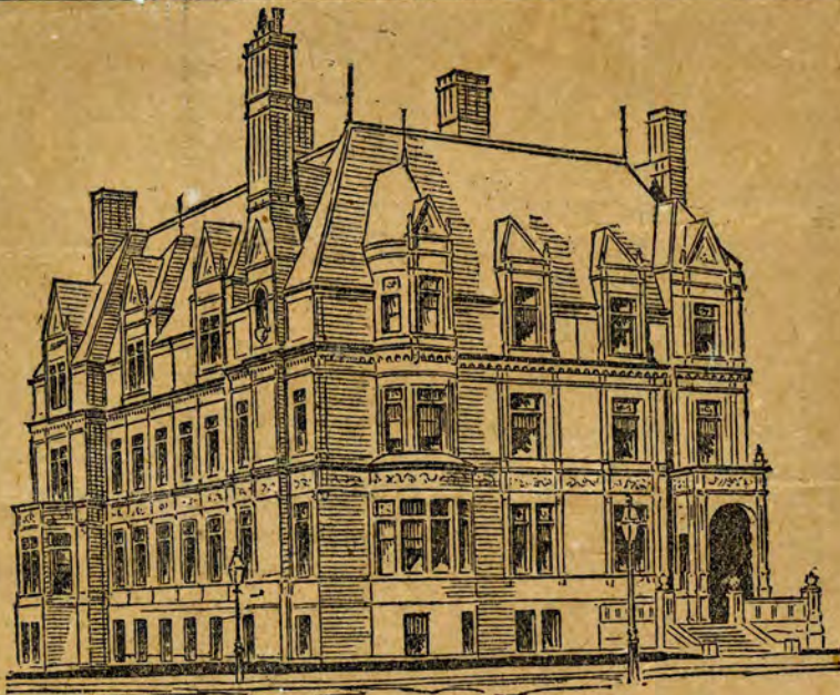
LIEUT.-GOV. AMES' HOUSE.

At the extreme of Commonwealth avenue, so far as it has been built upon, and at its junction with West Chester park extension, stands the "palatial residence" of Lieut.-Gov. Ames, one of the most spacious and commanding edifices for dwelling purposes in the Back bay region. The cut herewith shown fairly represents the proportions and general external features of the building. As will be noticed, these are on a grand scale, no pains or means having been stinted in the production of a house in every way characteristic of and appropriate to a gentleman of great wealth and high position, socially and officially. This